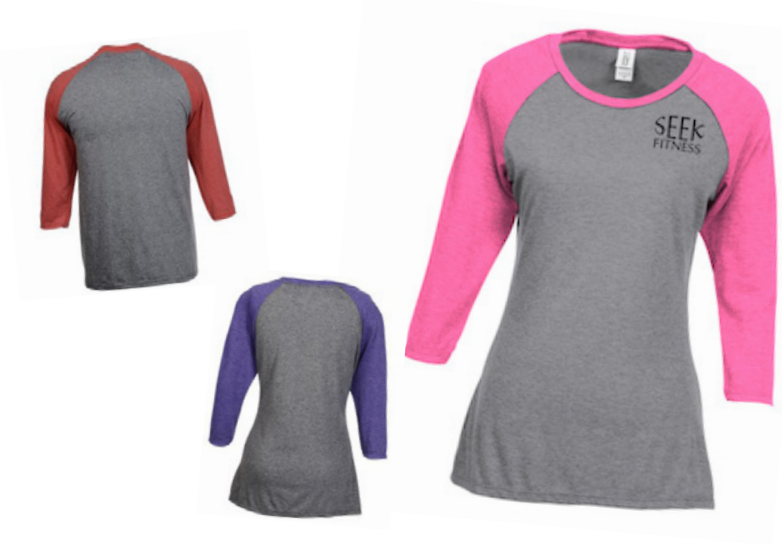
Item #137966-M Men's Sizes: XS-4XL. Colors: Red Frost, Purple Frost, Gray Frost, Royal Frost, Navy Frost, Black Frost, Frost White

Item #137966-L Women's Size: XS-4XL. Colors: Pink Frost, Red Frost, Purple Frost, Gray Frost, Royal Frost, Navy Frost, Black Frost, Frost White